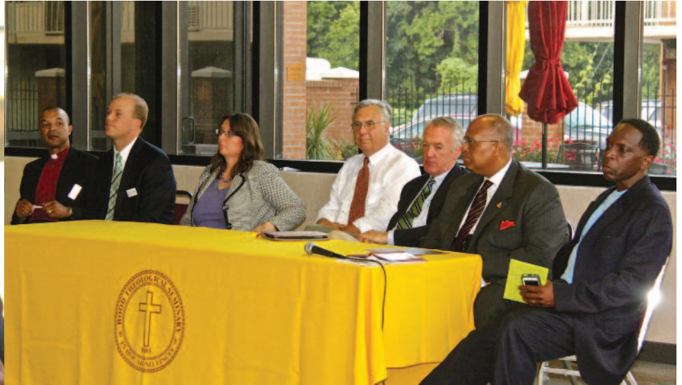
Panelists for the Forum