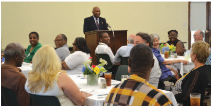
President Lattimore greets alumni and guests at a dinner hosted by HTS during the Western NC Conference of the United Methodist Church's Annual Conference at Lake Junaluska, NC, in June.