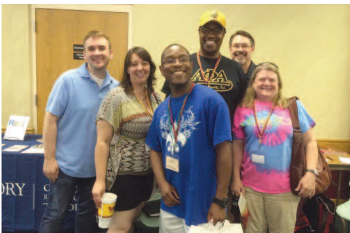
Alumni, students, and faculty had opportunities for fellowship at Lake Junaluska in June.