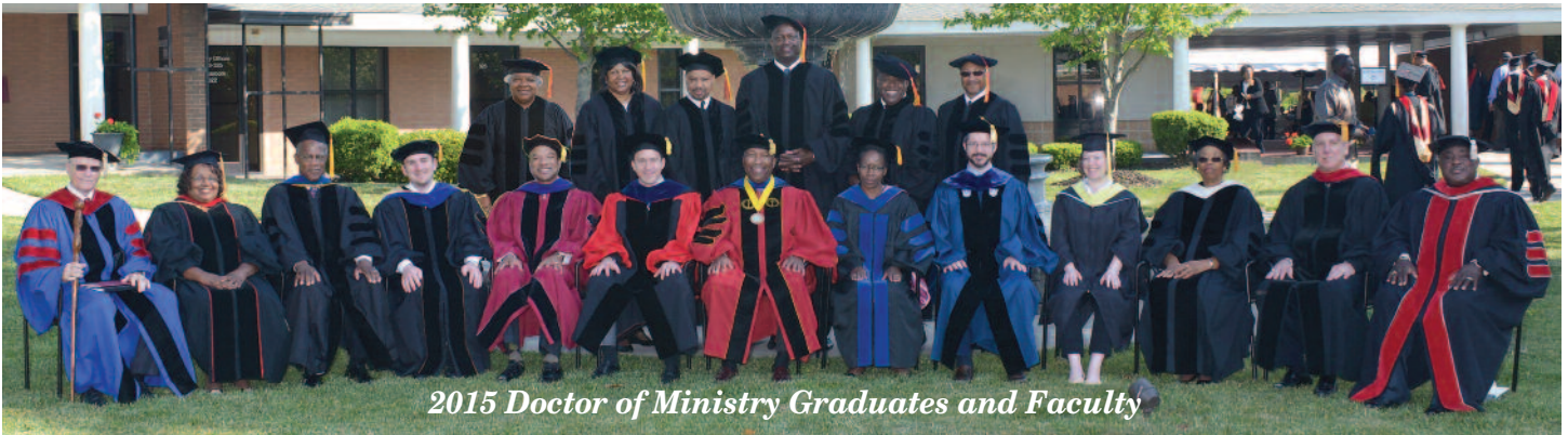
2015 Doctor of Ministry Graduates and Faculty